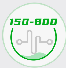
Voltage Range 150V-800V