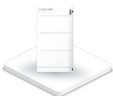
High Voltage Lithium Battery