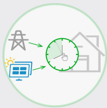
Flexible Setting for Charge