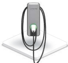
Smart EV Charger