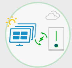
Compatible with High-current PV Modules