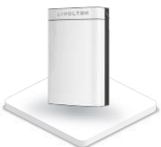
Residential Lithium Battery