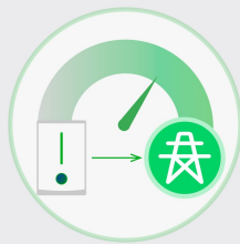
Export Control Function